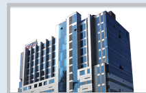
Global Hospitals, Mumbai