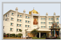
Global Hospitals, L.B. Nagar, Hyderabad