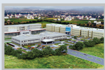
Global Health City, Chennai